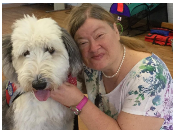
Therapy dogs visit The Arc's Day Program. Everyone looks forward to these visits.