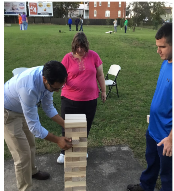
Fun, games, and great food were in ample supply at The Arc at Market Street. Our spacious grounds were the perfect setting.