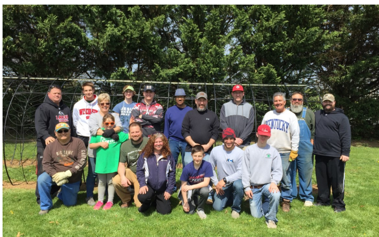
We are thankful for the many volunteers who helped beautify the grounds at The Arc at Market Street.

The Arc of Frederick County supports transiting youth students and adults to locate jobs in the community that incorporate their passions, interests, and personal talents. Career exploration, job training and development, and one-the-job coaching complement the needs of people served and the local businesses community. People served are competitively employed and earn a paycheck to sustain meaningful lives in their communities