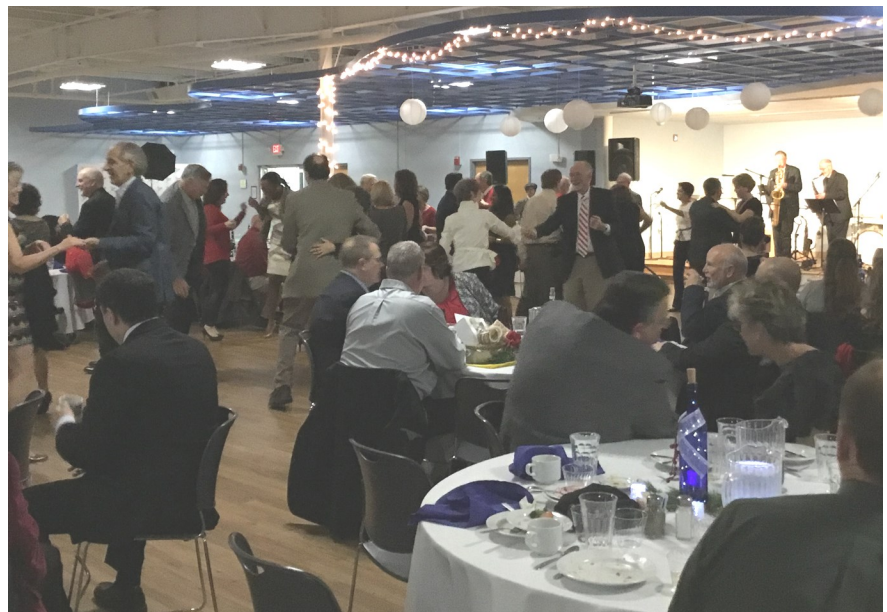
The Arc at Market Street meets the needs of a variety of groups who need a large space for their event. We have received wonderful feedback!