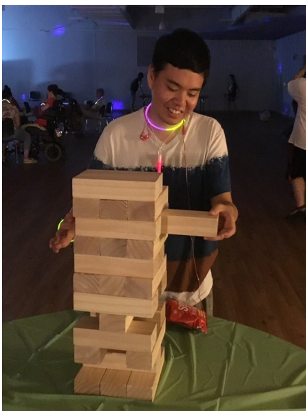
People we serve enjoyed a Glow Party with fun games and great music.

The Arc at Market Street serves as a versatile space to bring community together. Our event room and catering services are perfect for award celebrations, community trainings, concerts, art exhibits, and other unique, customized events. This past year the room was transformed into a Walk in the Park to celebrate the talents of local artists, served as a space for a Cabin Fever Concert , allowed the community to celebrate local award recipients, and was host to many events to support people we serve with exploring new activities such as yoga, hula hoop dancing, theatre, and more.