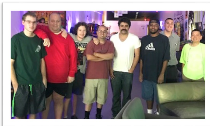
The "Guy Talk" group gave young men served by The Arc an opportunity to hang out, have fun, and talk about their concerns.

Support Coordinators partner with each individual and family to serve as a clinical and professional staff person to assist people to lead lives of their own choosing. Support Coordinators provide navigation services to build circles of support to promote personal reliance and contribution, make community connections, develop social networks, leverage existing resources, and coordinate natural and paid supports to address a person or family's needs. Navigation services are dynamic and designed to fit in the natural rhythm of a person's life.